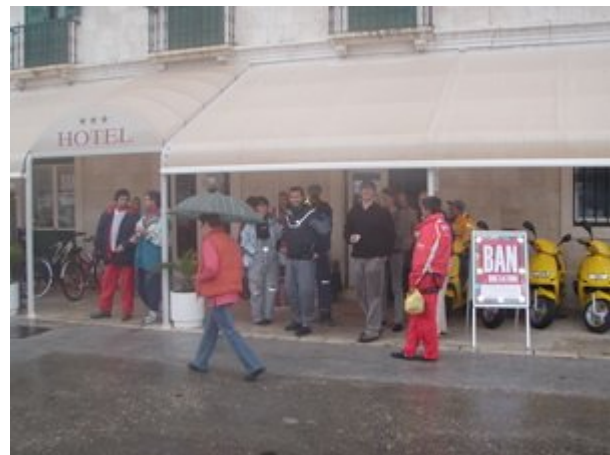
11:07 While President of Race Committee preparing requisites for the start, cheerful sailors enjoy the warm spring rain drizzling