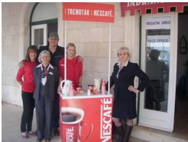
15:59 Ban posing with a friendly hostess and ahead of saturday's concert poster...