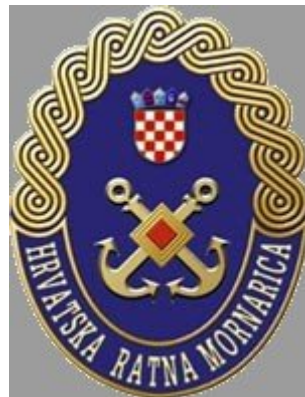
Securing of Race route