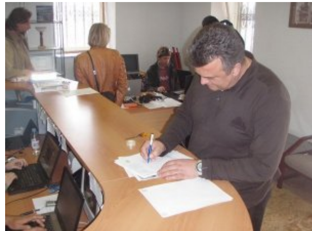
13:04 Vis crew first sign up as expected, and our Navy a couple of minutes behind them