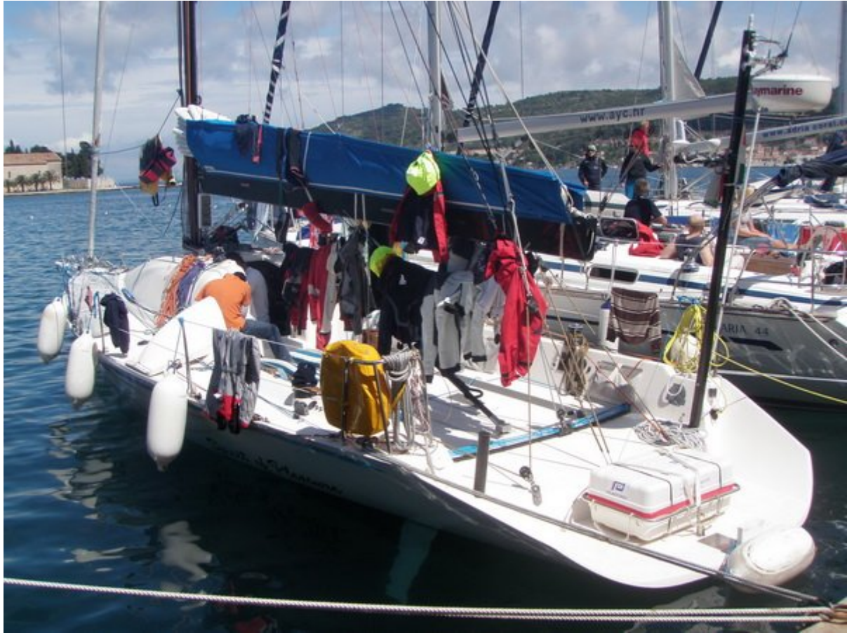
14:01 Hungarians were trained last year in Middle Sea Race to be ready for our race

15:36 While the director and secretary of the regatta inserted data, security equipment control is in progress.