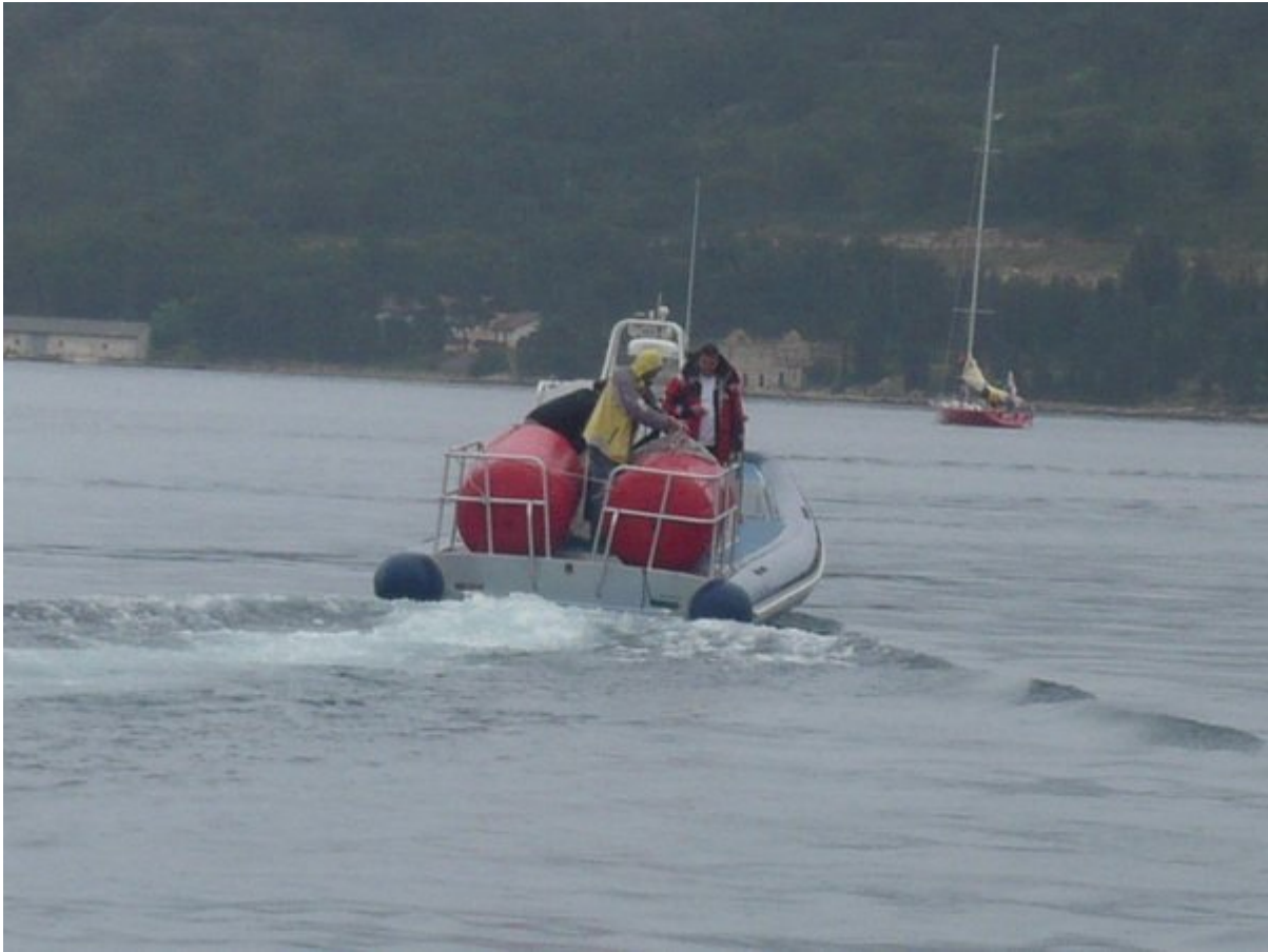
11:27 Colnago with speed of lightning rushes to the destination for the drowning buoys