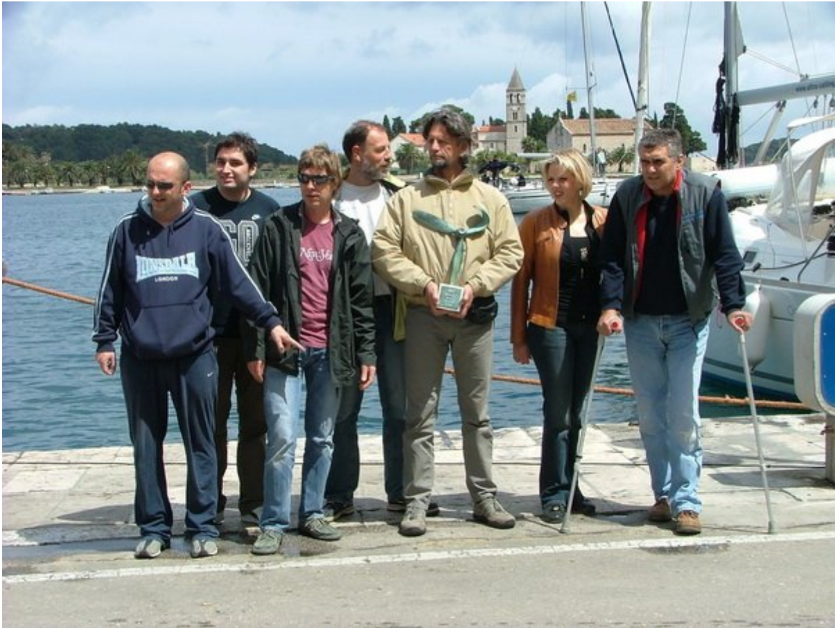
29.04.2009. Exactly at 12:00 ADRIATIC RACE TROPHY had come to light in the safe hands of the Race Committee