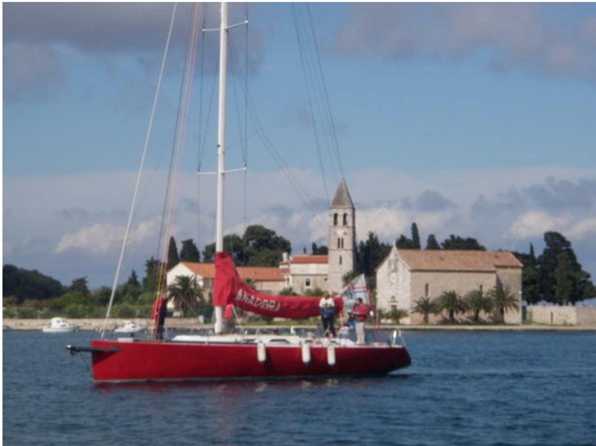
...Anadora entering in Vis