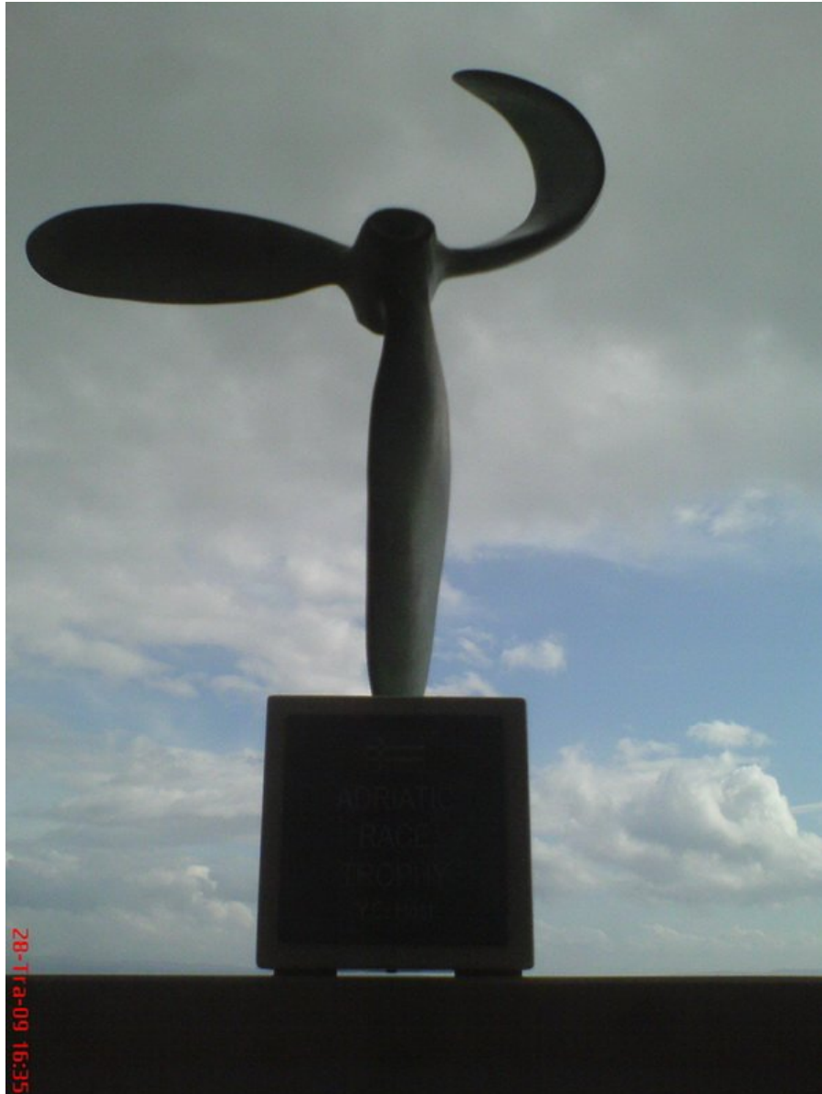
ADRIATIC RACE TROPHY - p r o p e l l e r