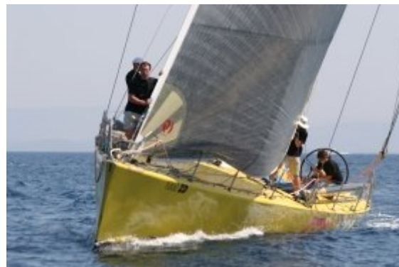
Course record holds the AAG Big One, with sailing time of 28 hours 41 minutes