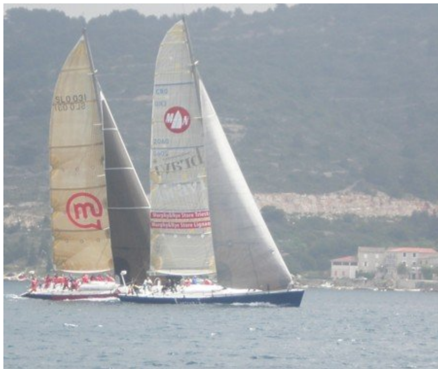
Last year's Maxi Duel in Vis harbor

The organization of Race has an excellent development